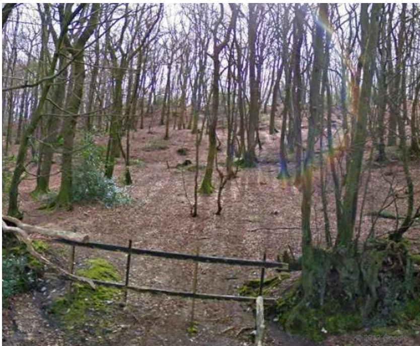
Google Street View Image March 2009 of Point B